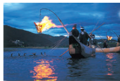
Ukai on the Nagara River

★11 . . . Nishikie refers to a multi-colored woodblock print of ukiyo-e