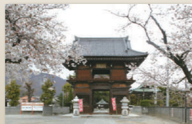
Entrance Gate of Ukaizan Onmyoji Temple

★14 . . . “Ukairyo-O Boreisaido” is one of the episodes of Saint Nichiren who saved the soul of the Uzukai Ghost by offering a memorial service. Buddhist scriptures were written on pebbles and thrown into the riverbed.