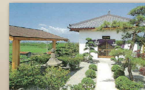
▲ “Osusuri-Mizu” on the right bank by the Man-nen-bashi Bridge <a well to get water for the ink-stone to write characters on the Kyo-ishi stone>