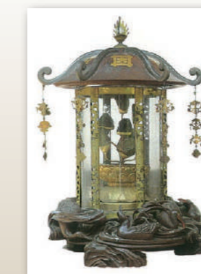
▲ “Nanajino-Kyo-ishi” of Onmyoji Temple, pebbles on which seven characters from Buddhist scriptures are written – a character on each pebble <packaged in a glass container>

The pebbles preserved at the Onmyoji Temple can be said to be the most famous Kyo-ishi in history