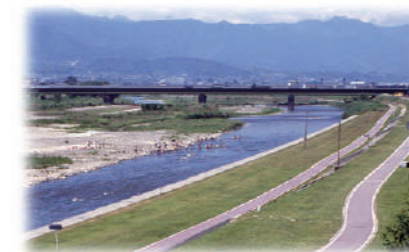
▲ The Fuefuki River where Isawa Ukai is held (The Isawa River used to flow in those days)